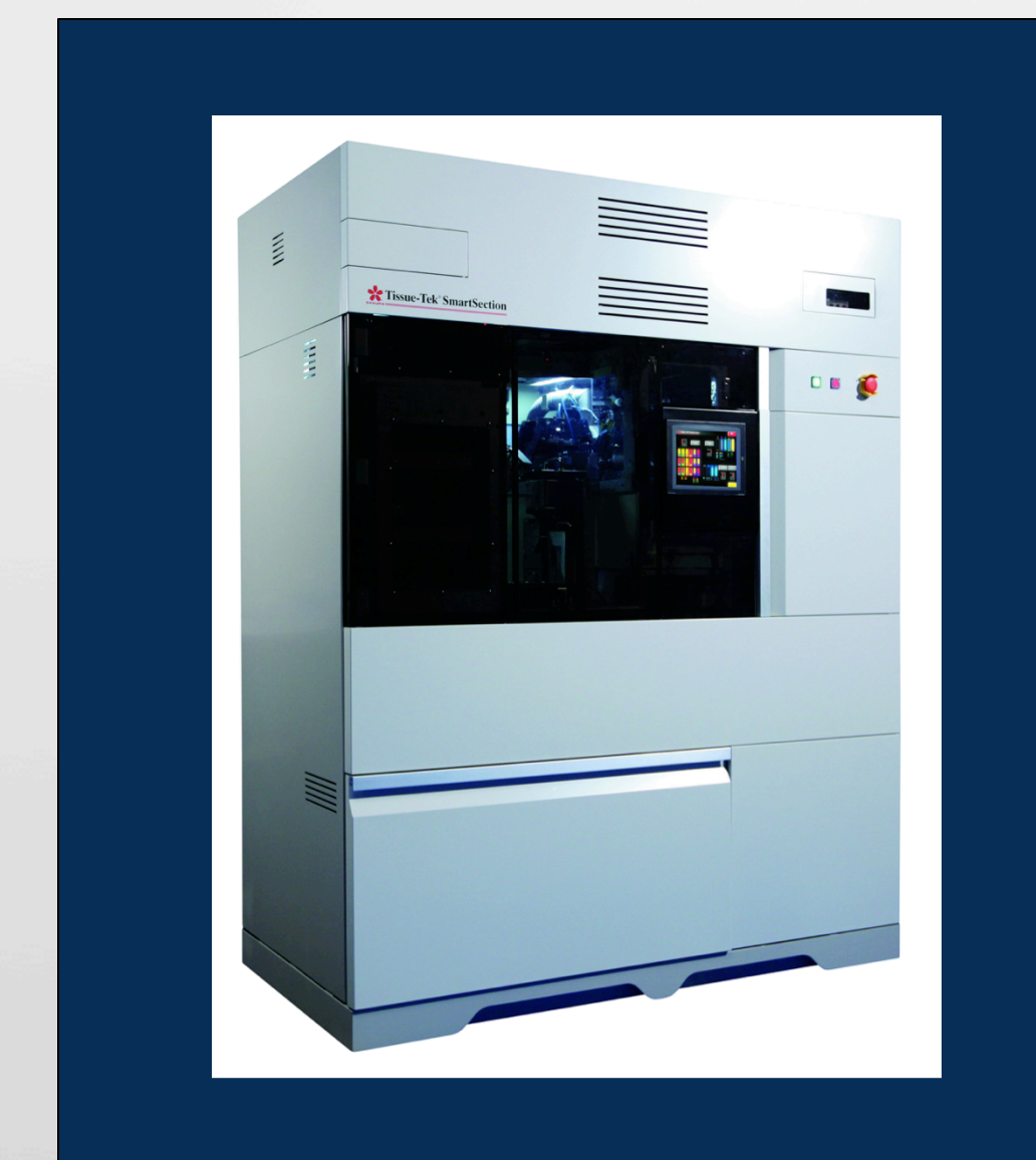
Figure 2. Fully Automated Robotic Microtomy Instrument (Tissue-Tek SmartSection).

Table 1. (Right) Sectioning sequence showing results from BRAF analysis on pooled DNA extraction samples.